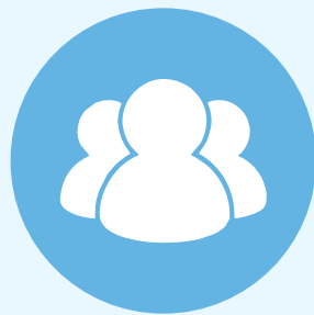
Monitoring Desk Team