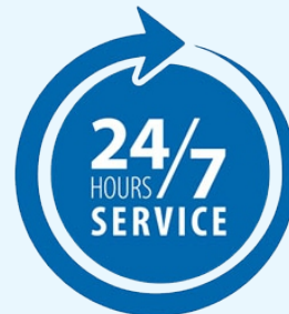
Social media chat escalation