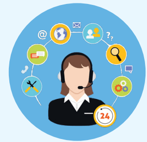
24x7 Network Operations Center