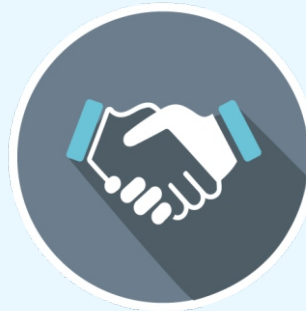
300 + satisfied clients