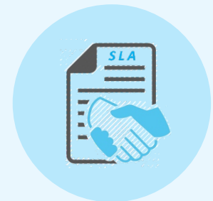
SLA > 95%