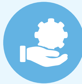
Advanced Customization Services