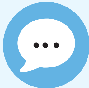
Social media chat escalation